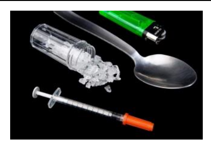
Figure 1 Example of methamphetamine and paraphernalia

An incident not related to drug task force activity in western Redwood County resulted in the seizure of approximately 226 grams of marijuana and 4.5 grams of methamphetamine.