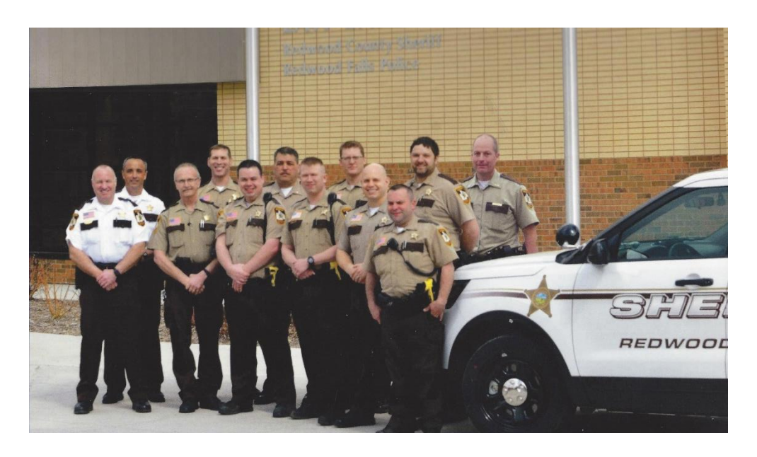
2016 Redwood County Sheriff's Office (Sworn Personnel)

This report is not all inclusive but rather a summary of the Redwood County Sheriff's Office community involvement and enforcement activity.