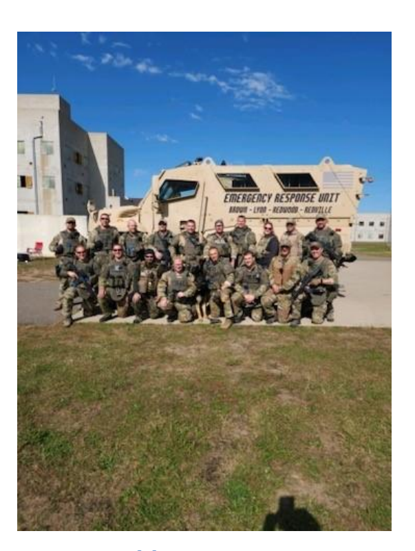
2022 BLRR ERU TEAM