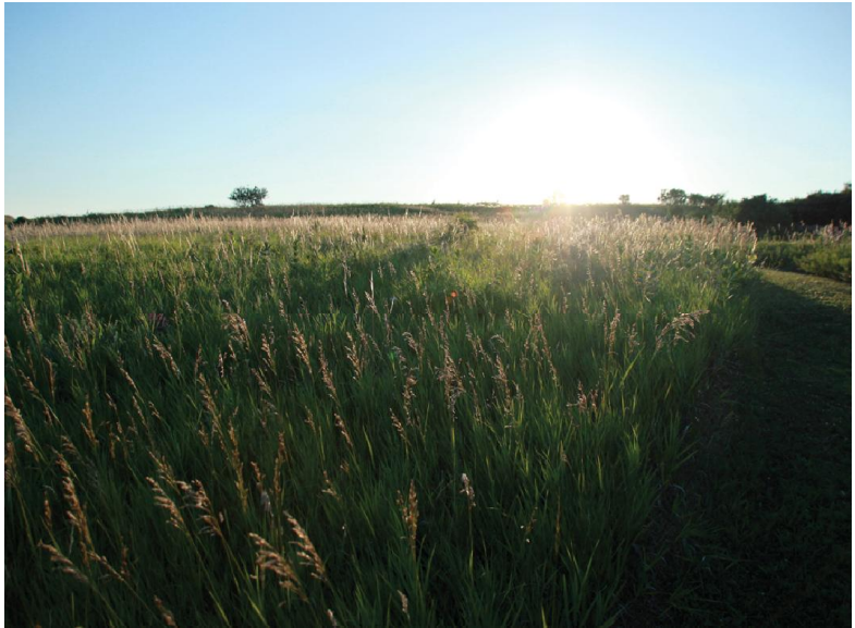
Winning picture of the 2016 photo contest