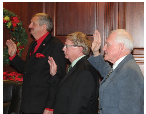
Taking Oath of Office on January 3, 2017