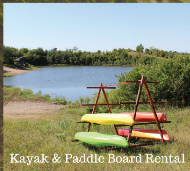
Kayak & Paddle Board Rental