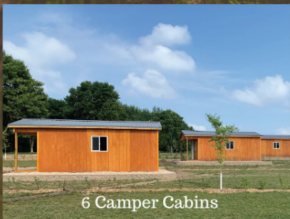
6 Camper Cabins