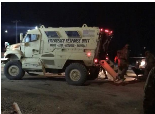
(ERU Team members exiting the MRAP during a training scenario)

December 7, 2018 – The BLRR ERU was activated to assist the Granite Falls Police Department with a search warrant. Three males and two females were secured, and the scene was turned over to the Granite Falls Police Department.