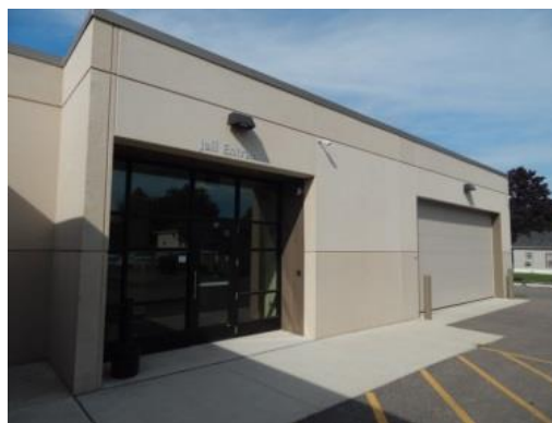
(Main Entrance to the Redwood County Jail)